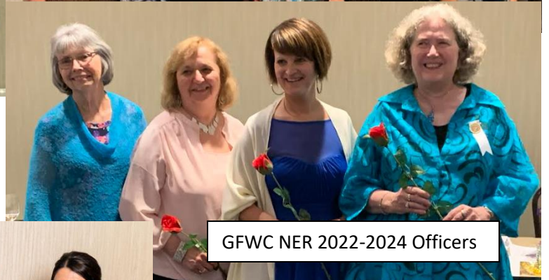
GFWC NER 2022-2024 Officers