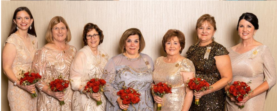
GFWC 2022-2024 Officers