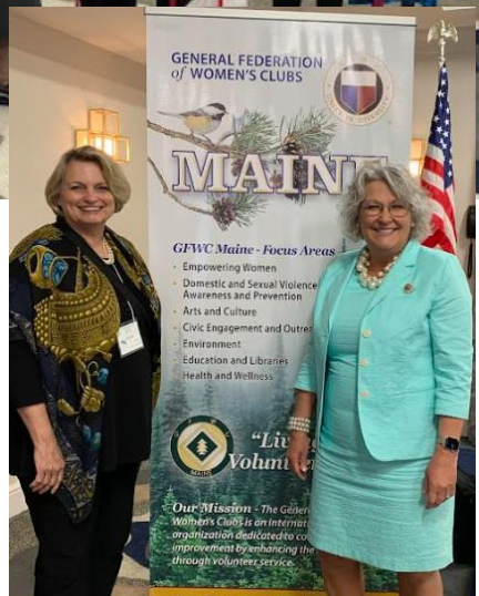
GFWC Maine 'Soaring to New Heights'